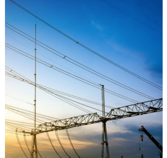
Construction of OHL 110 kV and part of SS Suffa 110/35/10 kV within the project of EPS of tourist recreational zone "Zomin"

The above is to show only some of the numerous ventures undertaken by RESBUD Group Companies.