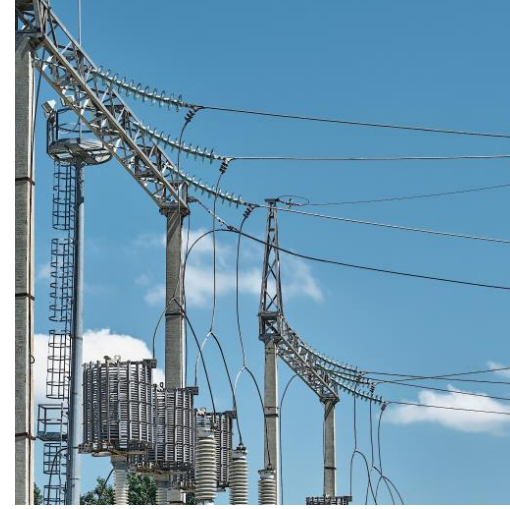
Construction of Turakurgan TPP with taps of OHL 220-110 kV