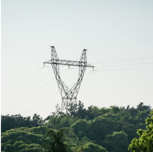
Construction of three single-circuit OHL 220 kV Nishon SS 220 kV SFES-ORU 220 kV Talimarjan TPP