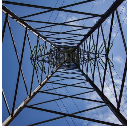
Construction of double-circuit OHL 110 kV within the project "Acceleration of constr-on of EPS facilities of Tashkent Cotton Textile LLC"