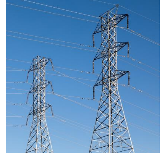
Construction of 110 kV OHL EPS of the special industrial engineering and electrical hub in Andijan district of Andijan region according to PQ-271

The above is to show only some of the numerous ventures undertaken by RESBUD Group Companies.