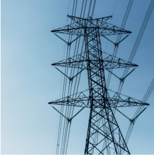
Construction of double-circuit OHL 220 kV from Sirdaryo TTP to Pechnaja SS and Metallurgija SS