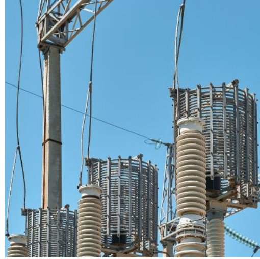
Construction of OHL 500 kV Surkhon SS – Khoja SS – Alvan (on the territory of the Republic of Uzbekistan)