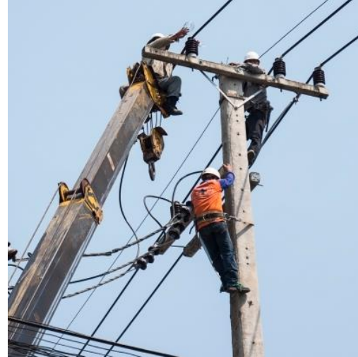
Construction of OHL 220 kV SDTES to SS Zafarobod 220 kV